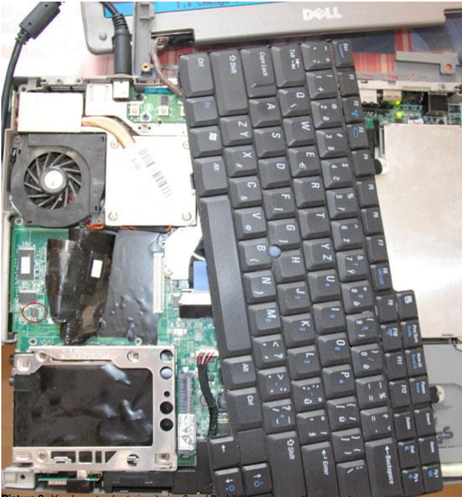
Picture 2. You have to short-circuit pins 3 and 6 while powering on the computer.

Wednesday, 04 March 2009 10:36 - Last Updated Friday, 13 March 2009 22:46